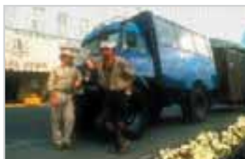
HOTEL BORG & "LUNAR BUS"

Shuttle from Reykjavik to Keflavik Airport . Optional stop, en route, for a swim in the hot, mineral-rich waters of Reykjanes, the "Blue Lagoon". Depart Keflavik mid-afternoon for ICELANDAIR flight back to New York/Baltimore/Boston. Evening arrival in U.S. (five hour time difference).